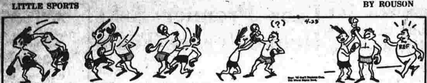
LITTLE SPORTS BY ROUSON