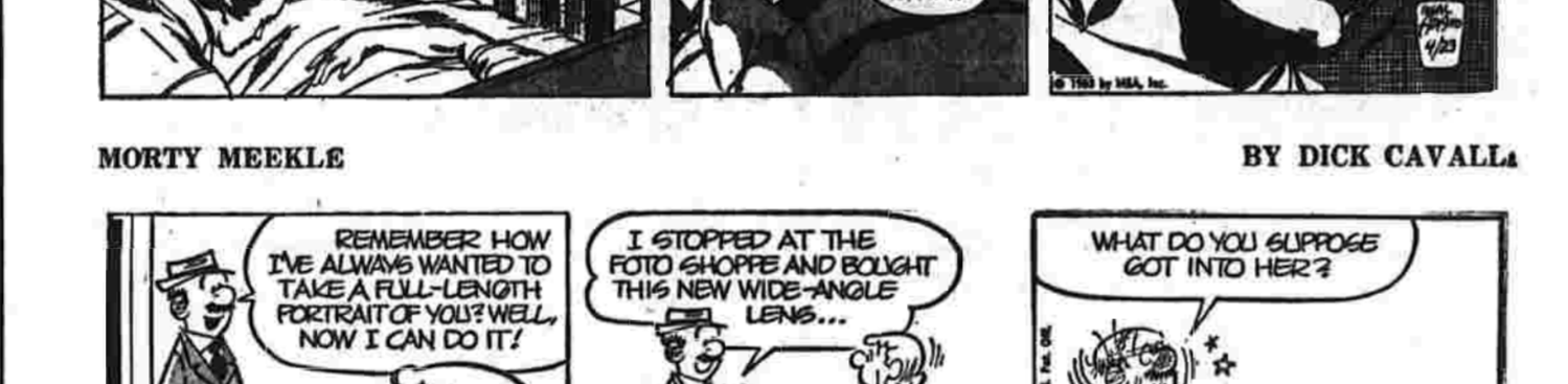
MORTY MECKLE BY DICK CAVALL