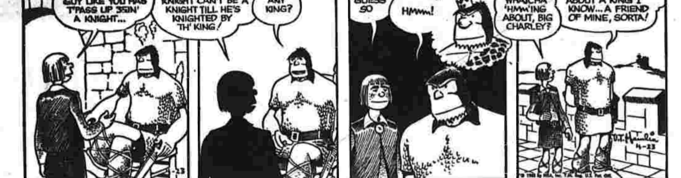
ALLY OOP BY V. T. HAMLIN