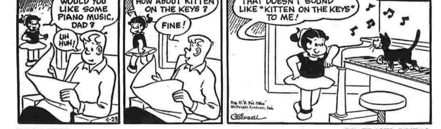
BONNIE BY JOE CAMPBELL